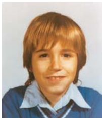
Original Photo At the age of 8 years-old (1984)