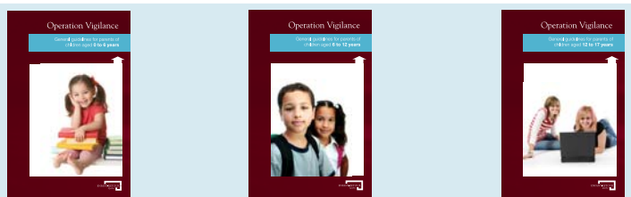
Operation Vigilance: Guidelines for parents of children from newborns to adolescence can be downloaded by visiting our website at www.enfant-retourquebec.ca

During times of crisis we are often reminded about the importance of teaching children about personal safety. As adults, we often hesitate discussing the risks of abuse and abduction with our children, feeling that we may frighten them or destroy their sense of joy of the world. Safety education helps build a child's confidence and critical thinking skills and prepares them for dangerous situations that they may encounter when home alone, surfing the Net, traveling to-and-from school or getting lost in public places. Adults need to empower children with age-appropriate information without inciting panic or fear. It is important to re-establish a child's sense of security.