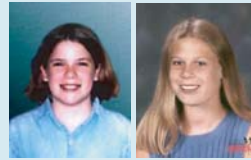
Original Photo At the age of 10 years-old (1999)