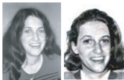
Original Photo At the age of 18 years-old (1979)